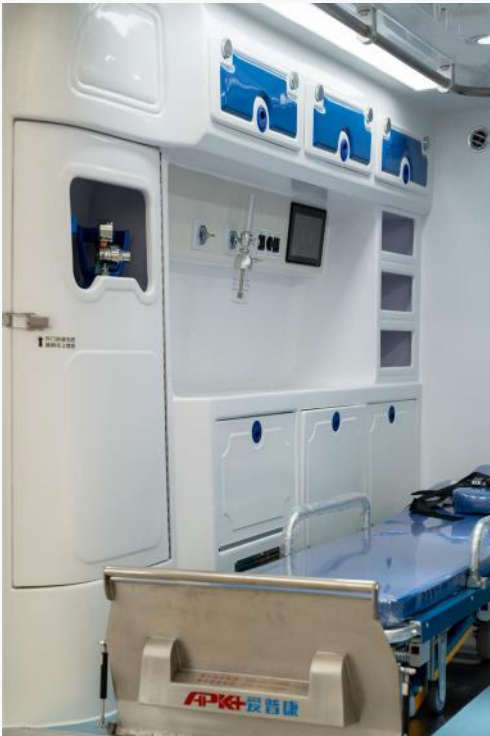
Different Interior Modifications